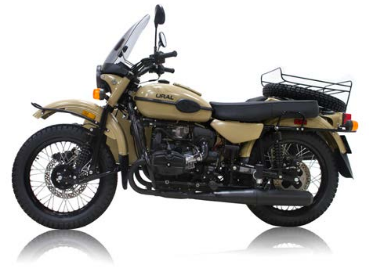
2018 Gear Up in Cascade Green Features: Black Engine, Clear Rider Fairing, Rear Rider Luggage Rack